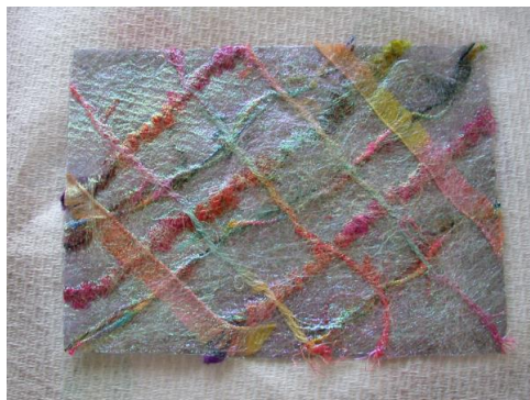
Figure 5: Angelina fabric with yarn bonded in.

Regardless of the thickness, you should be able to satin stitch and/or top stitch your Angelina applique pieces.