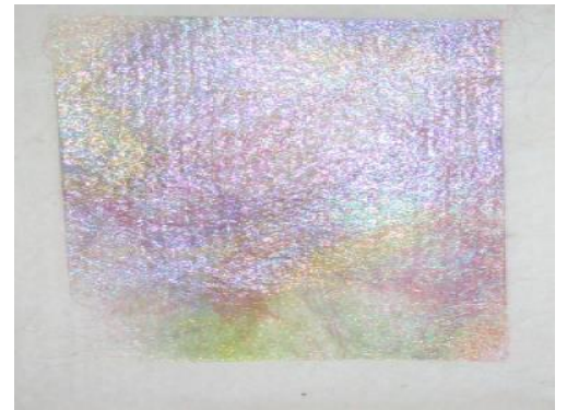
Figure 4: Angelina fabric with an edge.

Some Tips, Tricks, and Notes about Angelina to guide you as you experiment with this fun fiber: