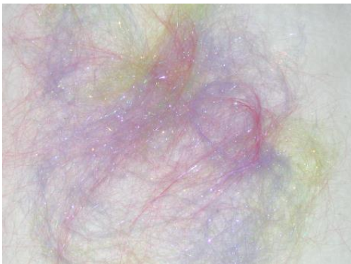
Figure 1: Three colors of Angelina in their raw, unbonded state (pink, blue, and yellow).

Note: McKenna uses white Angelina for the majority of her projects.