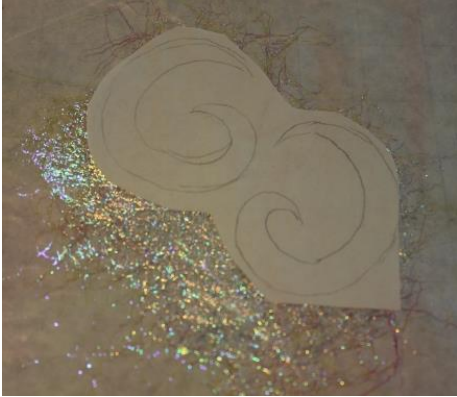
Figure 3: Fusible web ready to be pressed onto bonded Angelina fabric.