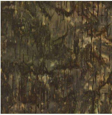
It is suggested that you use AYC-15471-16 Brown (pictured below)