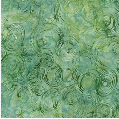
AMD-14303-169 Earth, used in Blocks 4, 5, 7, and 8